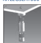
Available as optional KITLEGSEXT000