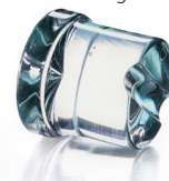
Ø 29 x H 34 mm