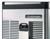
Front ON-OFF Switch Storage bin antibacterial pouch & holder