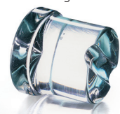
Ø 38 x H 41 mm

This product qualifies for the following listings: